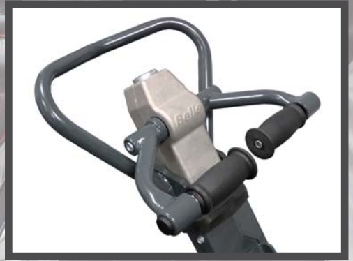
FIXED HANDLE TO AID TRANSPORTATION ON ROUGH TERRAIN