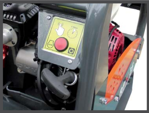
CENTRALLY LOCATED RECOIL START / STOP BUTTON CONTROLS (PETROL MODEL)