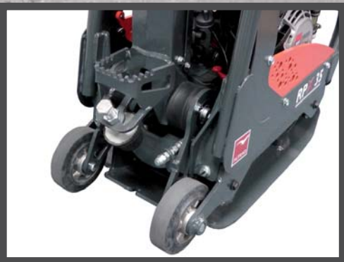
INTEGRATED WHEEL KIT READY FOR SAFE OPERATION