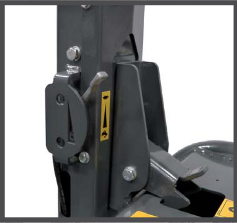
HANDLE MOUNTED THROTTLE, PERFECT FOR THE OPERATOR