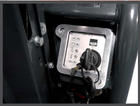
ELECTRIC, KEY IGNITION START & LED WARNING LAMPS (DIESEL ELECTRIC MODEL)